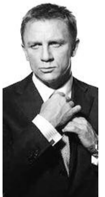
007 actor Daniel Craig

The premiere will take place on 29 October in Leicester Square with it going on general release in the UK on 31 October.