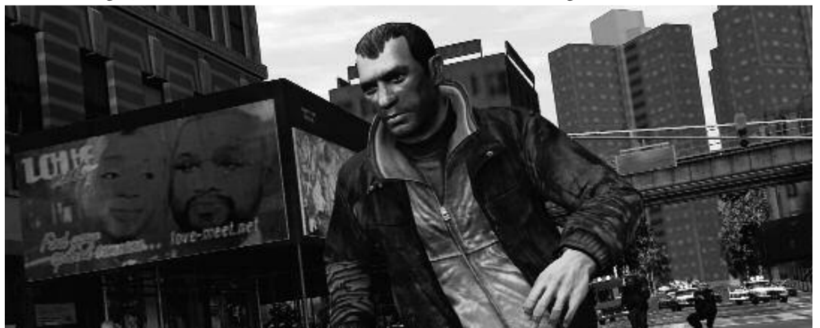
A scene from Grand Theft Auto IV

bate in support of the complaining parents. Conservative MP Iain Duncan Smith, wrote this week of his concerns: "I was astonished that the board could have seen fit to allow anyone under the age of 15 to watch the film."